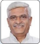
Hon'ble Shri Gajendra Singh Shekhawat Minister of Tourism Government of India

Session 1 : Ministerial Inauguration | 4:00 pm – 5:30 pm