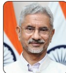
Hon'ble Dr. Subrahmanyam Jaishankar External Affairs Minister, Government of India