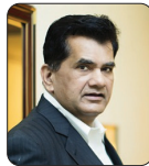
Mr. Amitabh Kant Former G20 Sherpa & Former CEO NITI Aayog

Session 2 : Fireside Chat – Indian Tourism: The World View | 5:45 pm – 6:15 pm