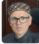
Hon'ble Shri Omar Abdullah Chief Minister of J & K

Session 1 : CM Keynote: Revival with Resolve | 10:00 am – 10:25 am