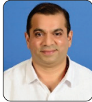
Hon'ble Shri Rohan Ashok Khaunte Minister for Tourism Government of Goa